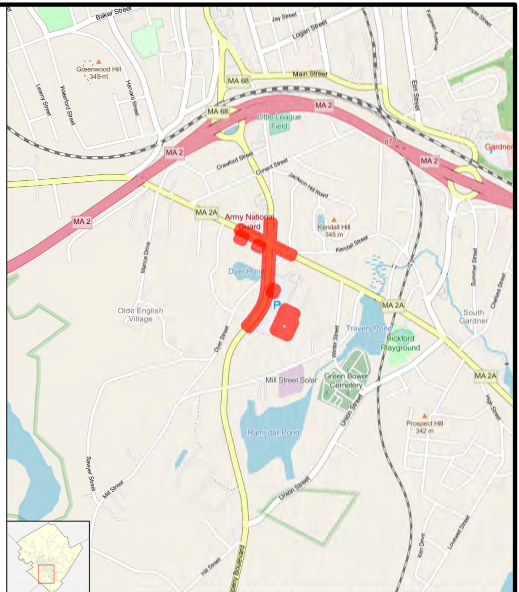
LOCUS MAP NOT TO SCALE