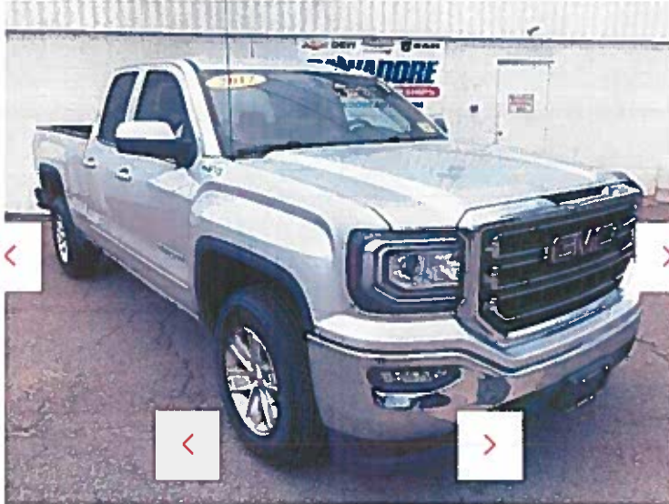
1 of 23