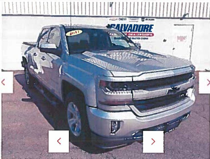
1 of 26